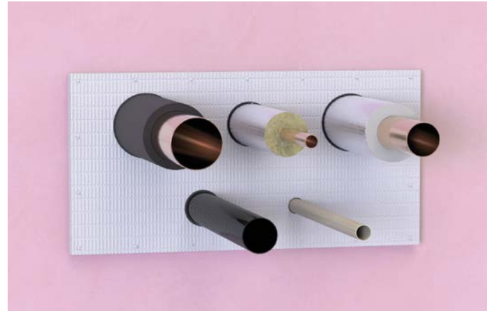
QuelCoil CE Marked Continuous Intuwrap used in conjunction with QuelStop Fire Batt