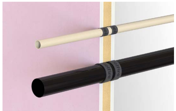
Cross section of QuelCoil Continuous Intuwrap installed directly into wall