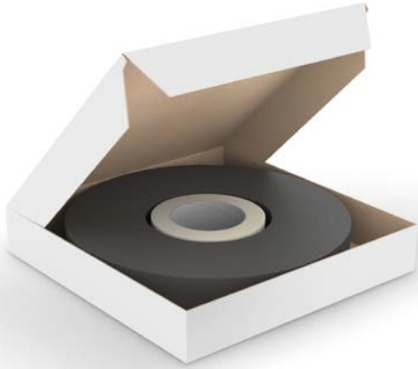
QuelCoil CE Marked Continuous Intuwrap

QuelCoil CE Marked Continuous Intuwrap is a universal intumescent pipe wrap used to maintain the fire rating of walls and floors where they have been penetrated by plastic pipes and/or metallic pipes with combustible insulation. It can be cut to length on site.