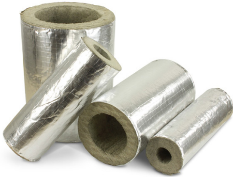
QIF Insulated Fire Sleeves

Quelfire QIF Insulated Fire Sleeves prevent the spread of fire through combustible and non-combustible pipes where they penetrate fire compartment walls and floors.