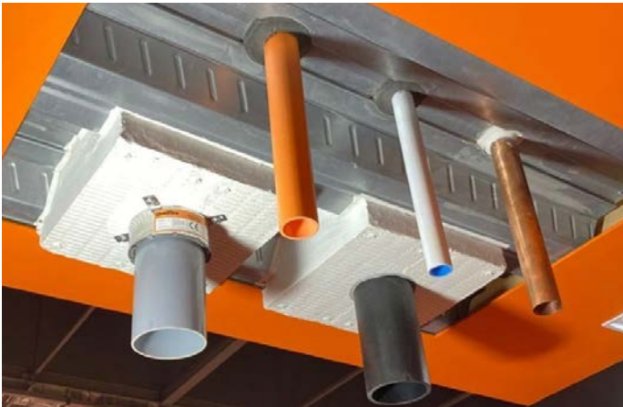
QuelStop Fire Batt installed as a pattress on a steel profiled deck