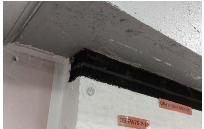
QuelStop Fire Batt used in conjunction with Quelfire Intufoam to allow for deflection in a head of wall seal