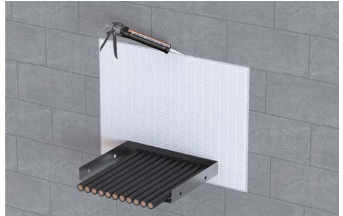
QuelStop Fire Batt used in conjunction with QuelStop Intumescent Acrylic Sealant