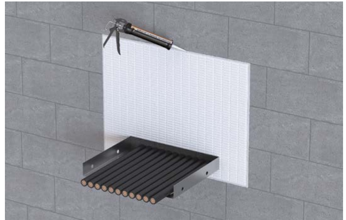
QuelStop Fire Batt in a wall penetration used in conjunction with QuelStop HPE Sealant to services