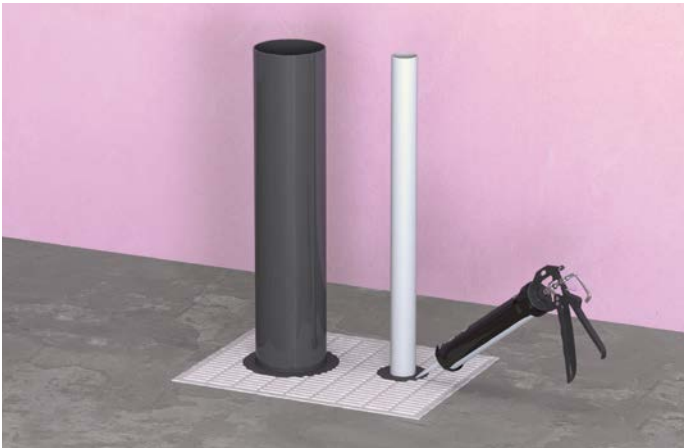
QuelStop Fire Batt used in conjunction with QuelStop Intumescent Sealants