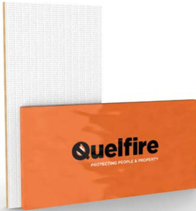
QuelStop Fire Batt

QuelStop Fire Batt is a coated mineral wool board used to reinstate the fire rating of wall and floor constructions where they have been penetrated by services.